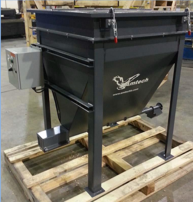
15 CUBIC FEED PRE-COAT FEEDER Made in the USA